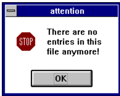
Figure 3: MessageBox

messagebox Mb { .text "There are no\nentries in this\nfile anymore!"; .title "attention"; .icon icon_error; .button[1] button_ok; .button[2] nobutton; .button[3] nobutton; }